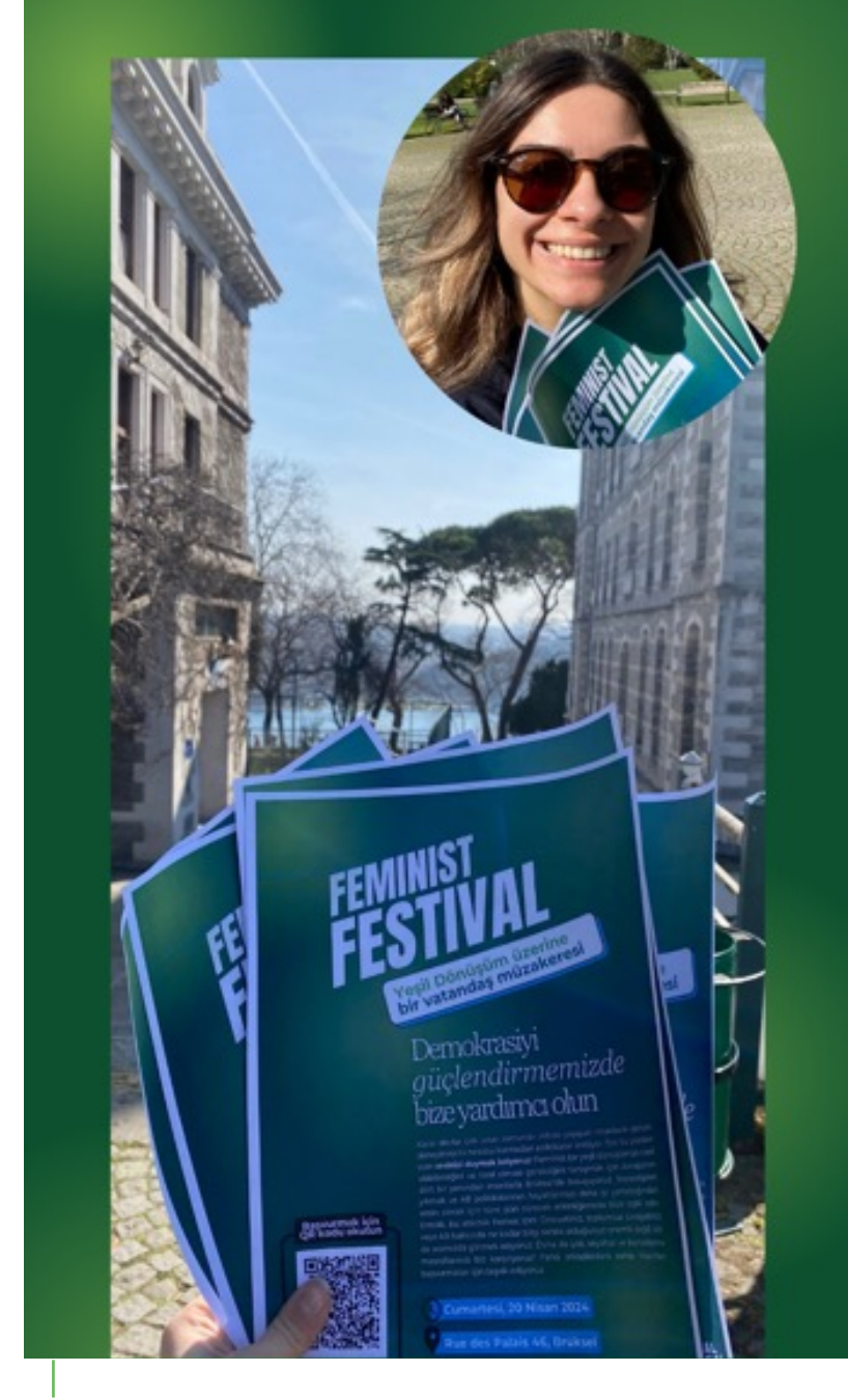
A dissemination volunteer posting the event flyer on a student campus in Istanbul.

The event was promoted by targeting marginalised groups through social media adverts. An outreach plan mapped traditionally excluded groups and provided tips for how REAL DEAL partners could reach them.